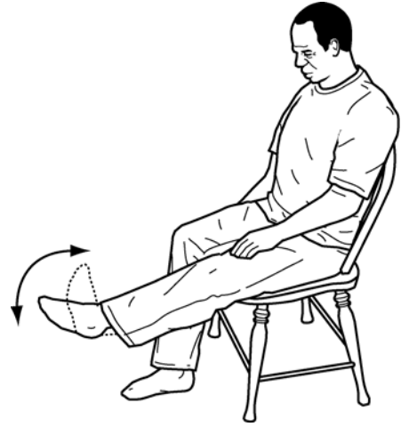
jimicsiyo kuraanta ah